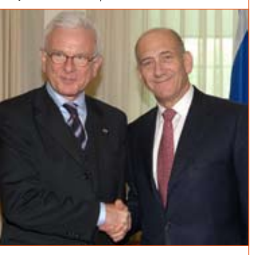
President Pöttering meets Israeli Prime Minister Ehud Olmert Jerusalem, 30 May 2007

"It is my intention to visit the European Union's neighbouring Arab states ... and promote the dialogue with the Middle East, and (between) Israel and the Arab world. ... We are convinced that the people of Israel and Palestine are linked by their common human dignity ... and have an equal right to live in a State of their own" (President Pöttering, Inaugural speech, 13 February 2007)