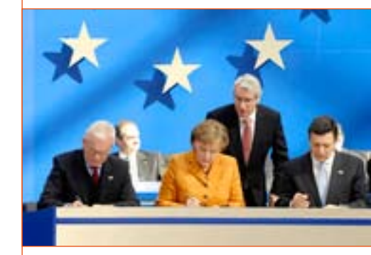
Signing ceremony of the Berlin Declaration by the Presidents of the EU institutions Berlin, 25 March 2007