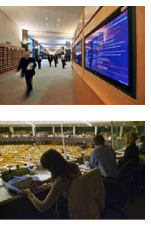
More interpretation, more information for the Members of the European Parliament