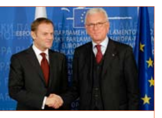
President Pöttering meets with Polish Prime Minister Donald Tusk Brussels, 4 December 2007