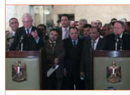
Official visit to Egypt, press conference with Dr. Ahmed Fathy Sorour, Speaker of the People's Assembly of Egypt Cairo, 24 February 2008