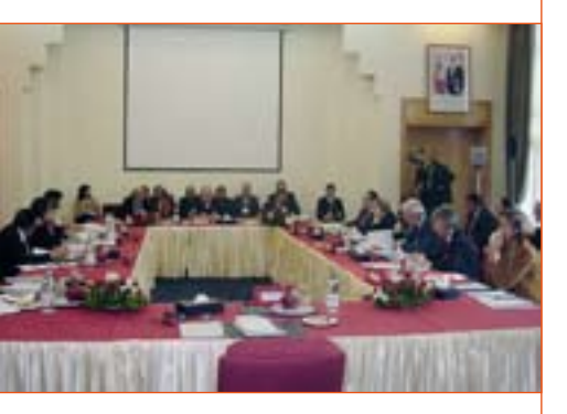
Bureau meeting of the Euro-Mediterranean Parliamentary Assembly Tunis, 17 March 2007

off and limited initiative, but should be understood as a continuous endeavour that will need to be pursued at all levels - regional, national, European, and indeed global - in the future. Such an on-going 'dialogue of cultures' is essential in encouraging peaceful co-existence and mutual understanding, both within the European Union and beyond. By holding a constant and regular dialogue of this kind, we can get to know each other better, respect each other's diversity, and hopefully work together as strong and trustworthy partners.