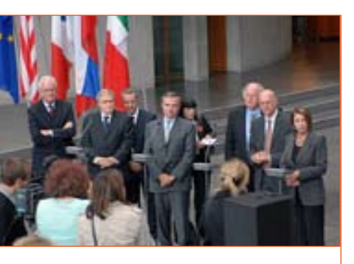
Press conference after the G8 Speakers' meeting in Berlin Berlin, 8 September 2007