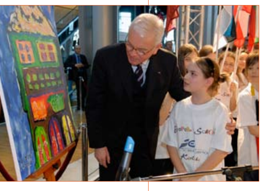
Building a better life for future generations Strasbourg, 12 March 2008

This Mid-Term Review offers an appropriate moment to look forward to the challenges ahead. Just before the end of President Pöttering's two and a half years in office, European citizens will elect a new European Parliament. These European elections in 2009 will put the work of the Parliament to the ultimate democratic test. The objective must be to ensure that the advances and progress registered in the last fifteen months - and the commitment and energy still to be devoted to the second half of his term - bring dividends in terms of higher voter turn-out and a greater appreciation of the role and power of the only directly-elected component of the EU's emerging political system.