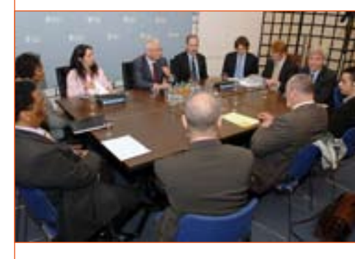
President Pöttering meets representatives of the Netherlands National Council for Minorities Den Haag, 12 April 2007