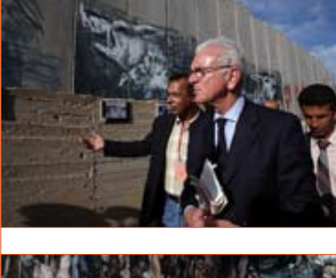
President Pöttering walks along the wall in the Qalandia refugee camp West Bank, 28 May 2007