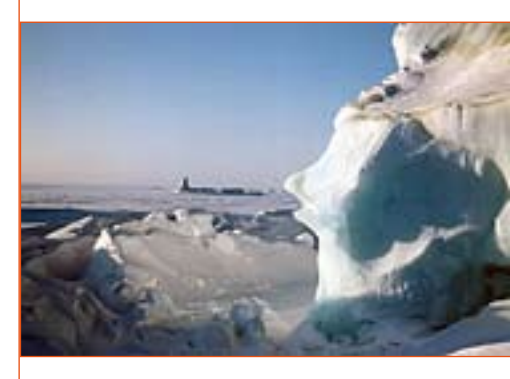
Melting ice in the Arctic